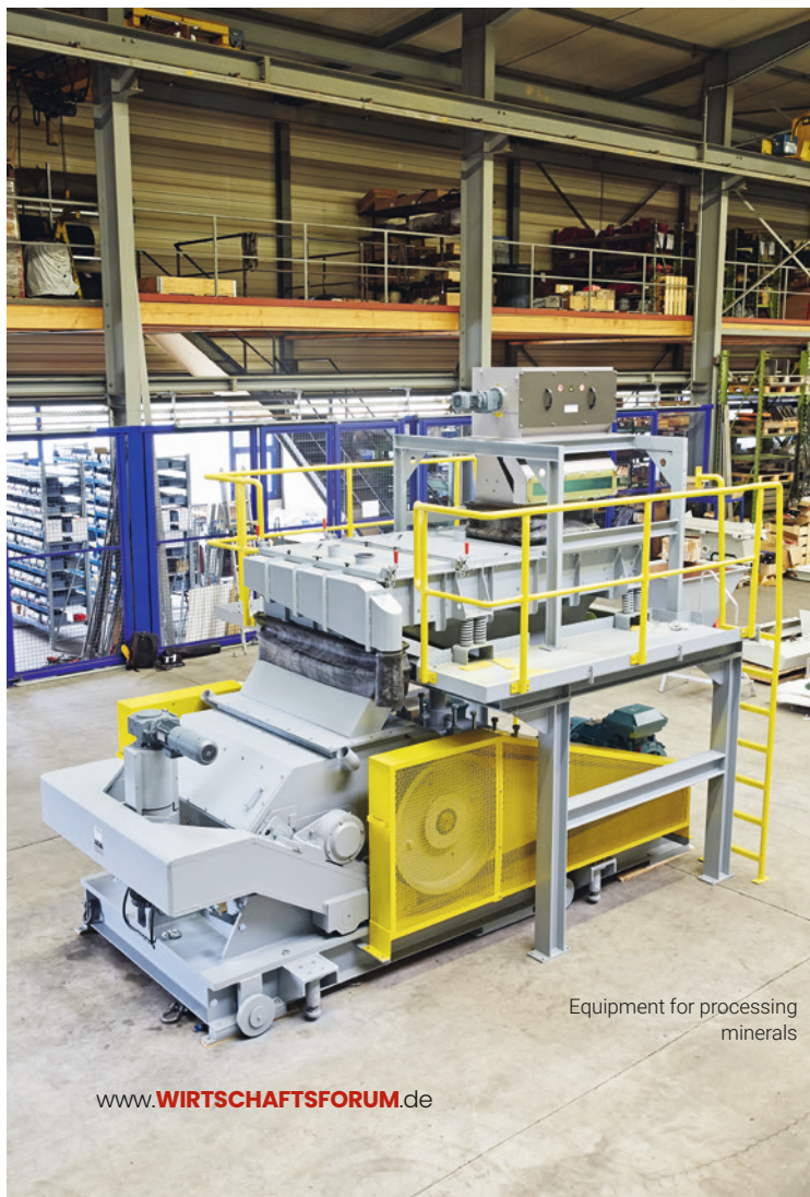
Equipment for processing minerals